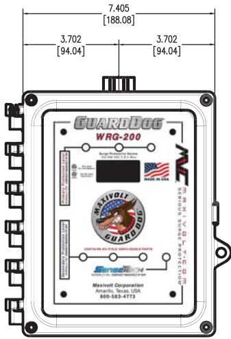
Approx. 9.5"H 8.7"W 5.6"D

Maxivolt GuardDog® • Made in USA • Serious Surge Protection • Made in USA • Maxivolt GuardDog® • Made in USA • Serious Surge Protection • Made in USA • Maxivolt GuardDog®